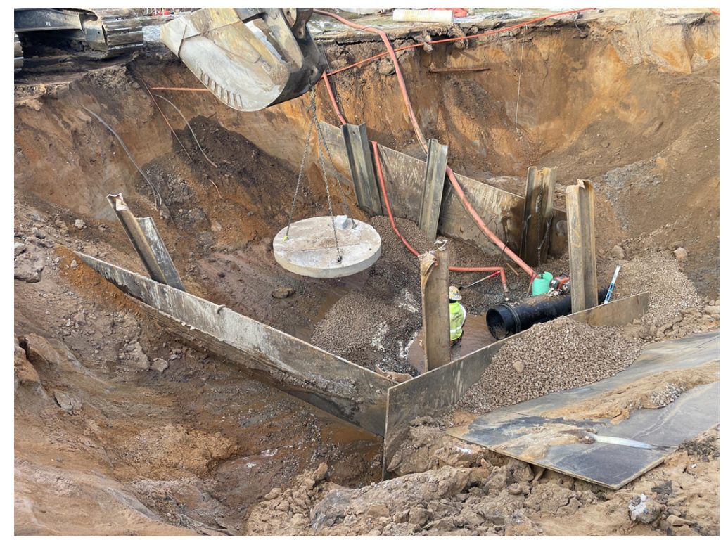
Photo #2: Lowering base slab for manhole into trench to be set - Dec 19, 2023, 10:14 AM