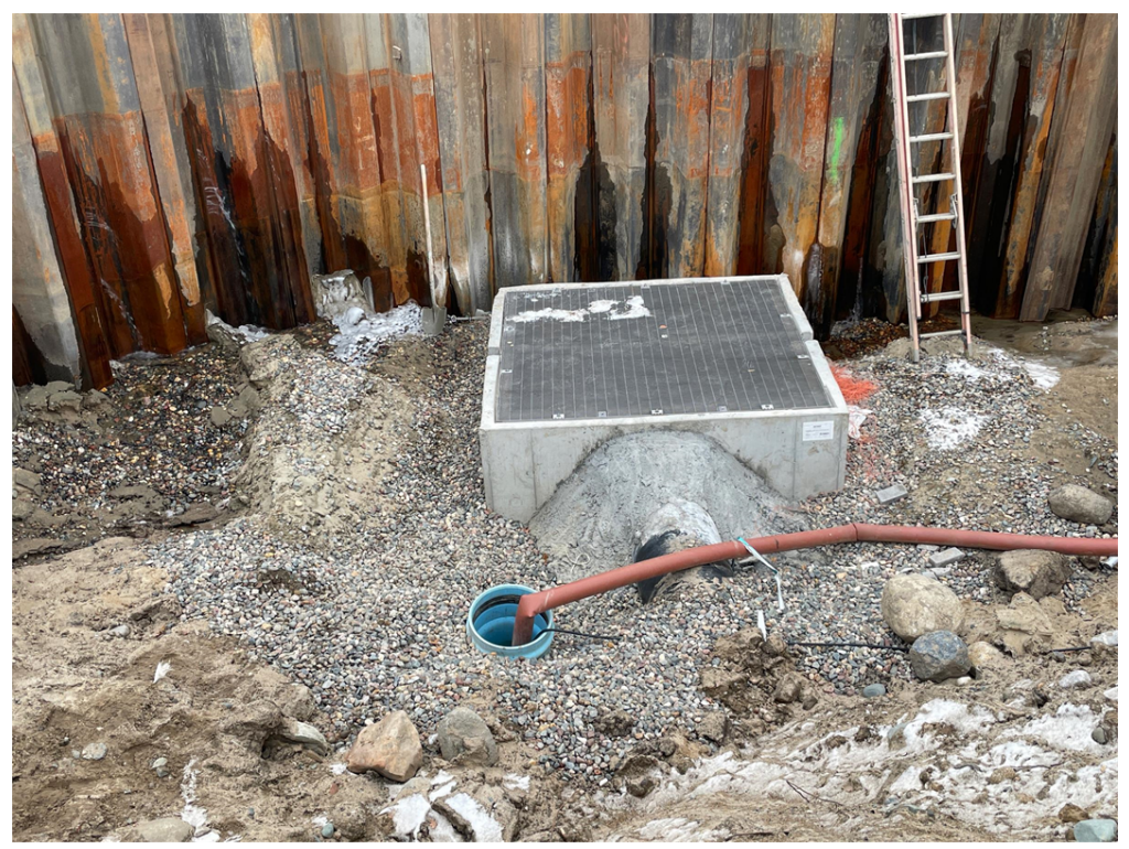
Photo #4: Inlet structure installed with screen - Dec 19, 2023, 3:10 PM