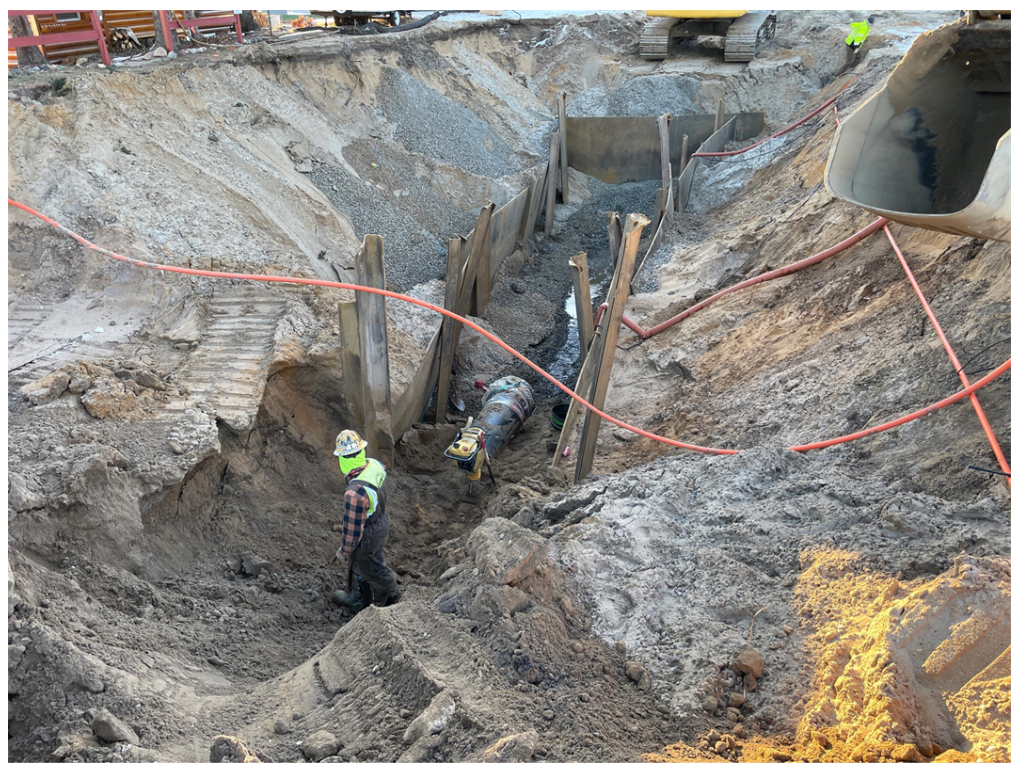
Photo #1: Preparing the trench for the next length of gravity flow pipe - Dec 18, 2023, 8:46 AM

*All information for this report was collected from the Houston Resident Project Representative's Logs.