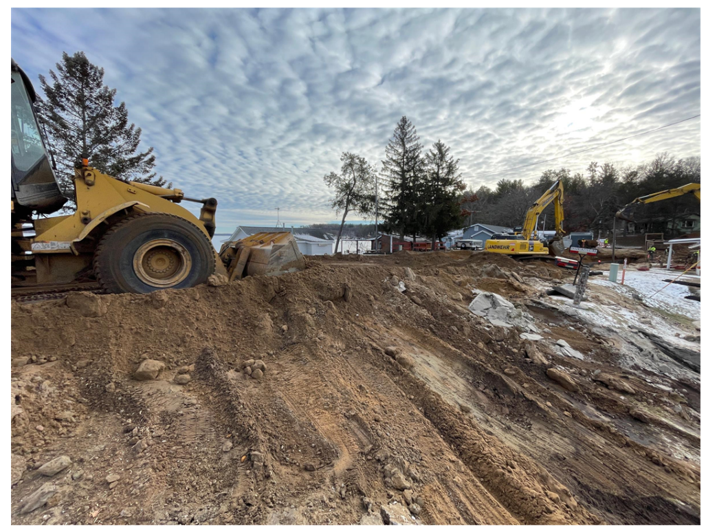
Photo #3: Backfilling over the top of the gravity flow pipe and backwash pipe on Aztec Road - Dec 19, 2023, 11:00 AM