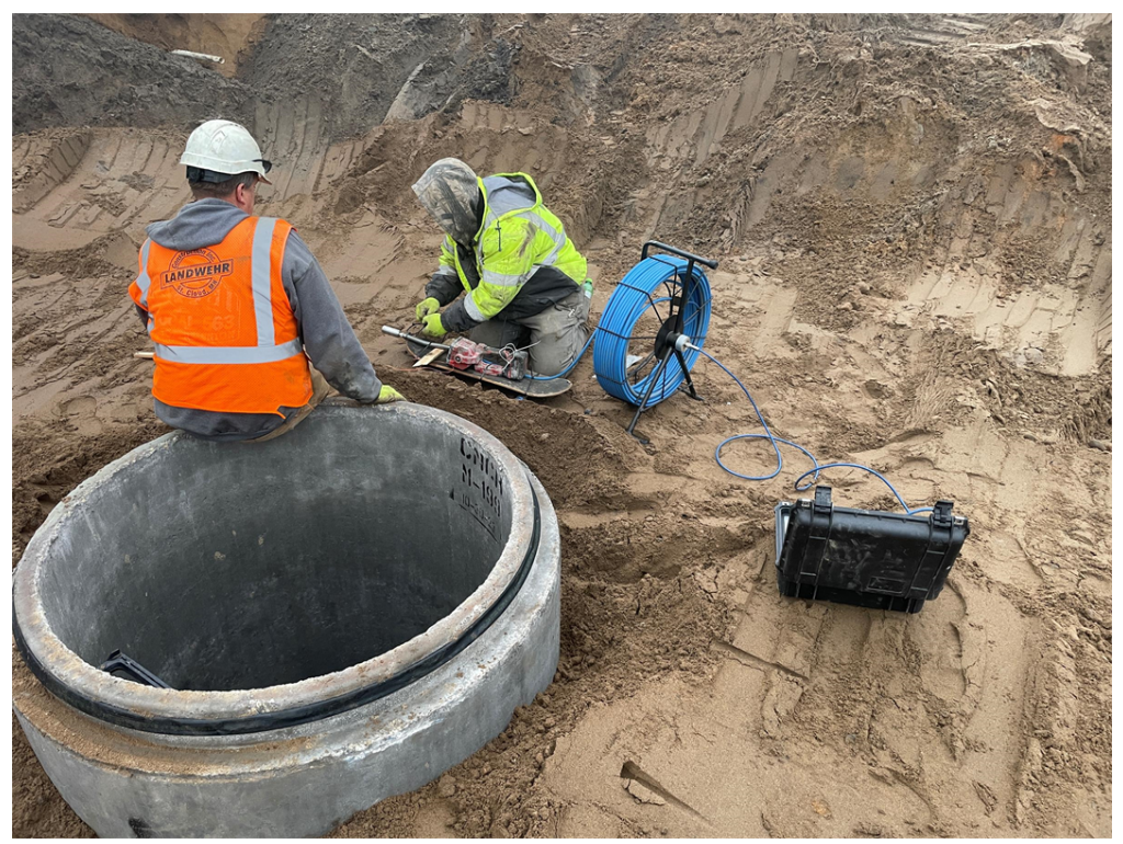
Photo #7: Preparing to televise gravity flow pipe - Dec 22, 2023, 8:37 AM