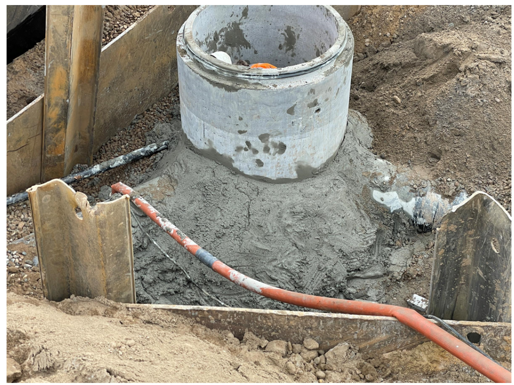
Photo #6: Concreting in pipes going into and out of manhole structure in Aztec Road - Dec 21, 2023, 10:44 AM