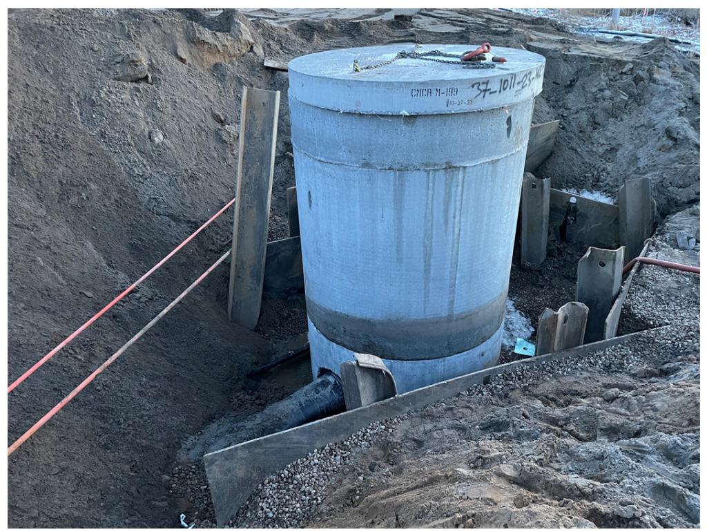
Photo #5: Wet well structure in place with top slab added - Dec 20, 2023, 4:47 PM